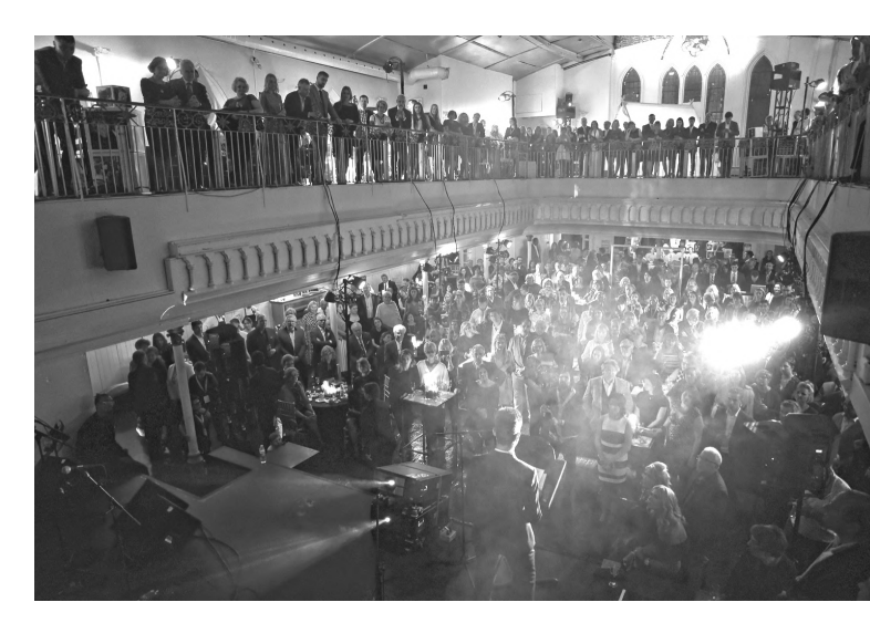
ANNUAL REPORT / PAGE 6

On May 3rd, 2019, at the Berkeley Church in Toronto, we celebrated our 25-year milestone with a gala featuring interactive and informative installations about our work in Ukraine. Our special guests from Ukraine - graduates of the residential institution system - spoke about the impact the organization has had on their lives, and our partners from the veteran NGO 'Pobratymy' spoke about our collaborative work. In total, $80,000 CAD was raised to support Help Us Help Summer Camp 2019.