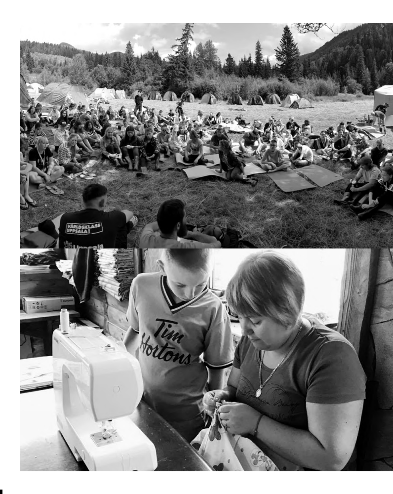
ACTIVITIES & PROJECTS CONTINUED ON PAGE 10...

The 24th Annual Summer Camp was held at the Avanhard Sports Base in Vorokhta and in "Pihy" Tatariv, both in the Ivano-Frankivsk region of Ukraine.