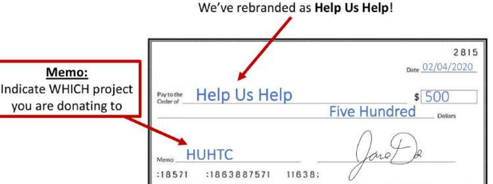
As always, donations over $20 are eligible for a federal tax receipt.

Leaving a legacy gift to Help Us Help is a promise to help form an ever-brighter future for Ukrainian children and Veterans, for generations to come. Visit our website to download your copy of a Help Us Help Legacy Package.